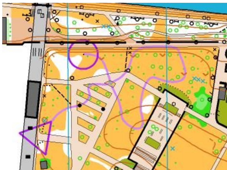
Cemetery - back side of the map (example)

This year, the “Cemetery of Controls” will be special: