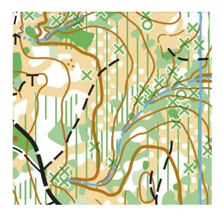
Samples of older maps: