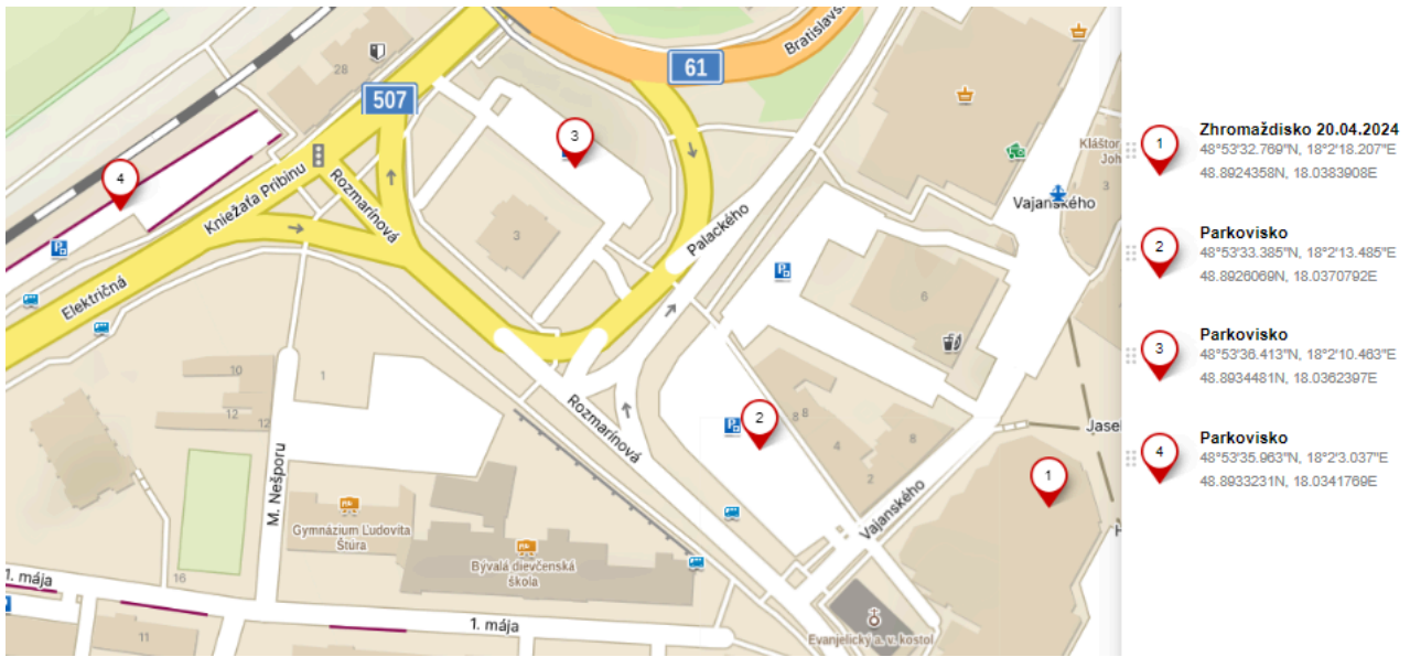
Fig. 1: Situation map (Trenčín): race assembly area and parking possibilities