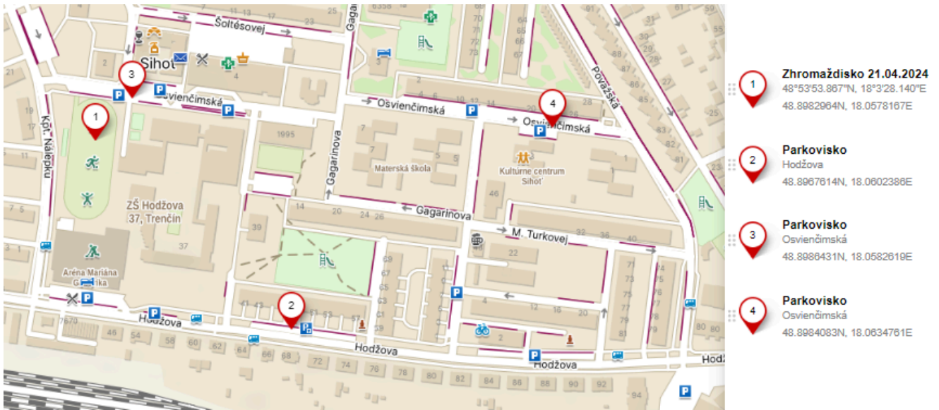
Fig. 1: Situation map (Trenčín): gathering place of the race and parking options